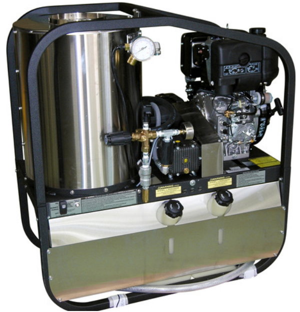
SW900 Bare Unit

The SW800 is available in 4 packages to suit your individual needs and budget. These can be seen on the next page.